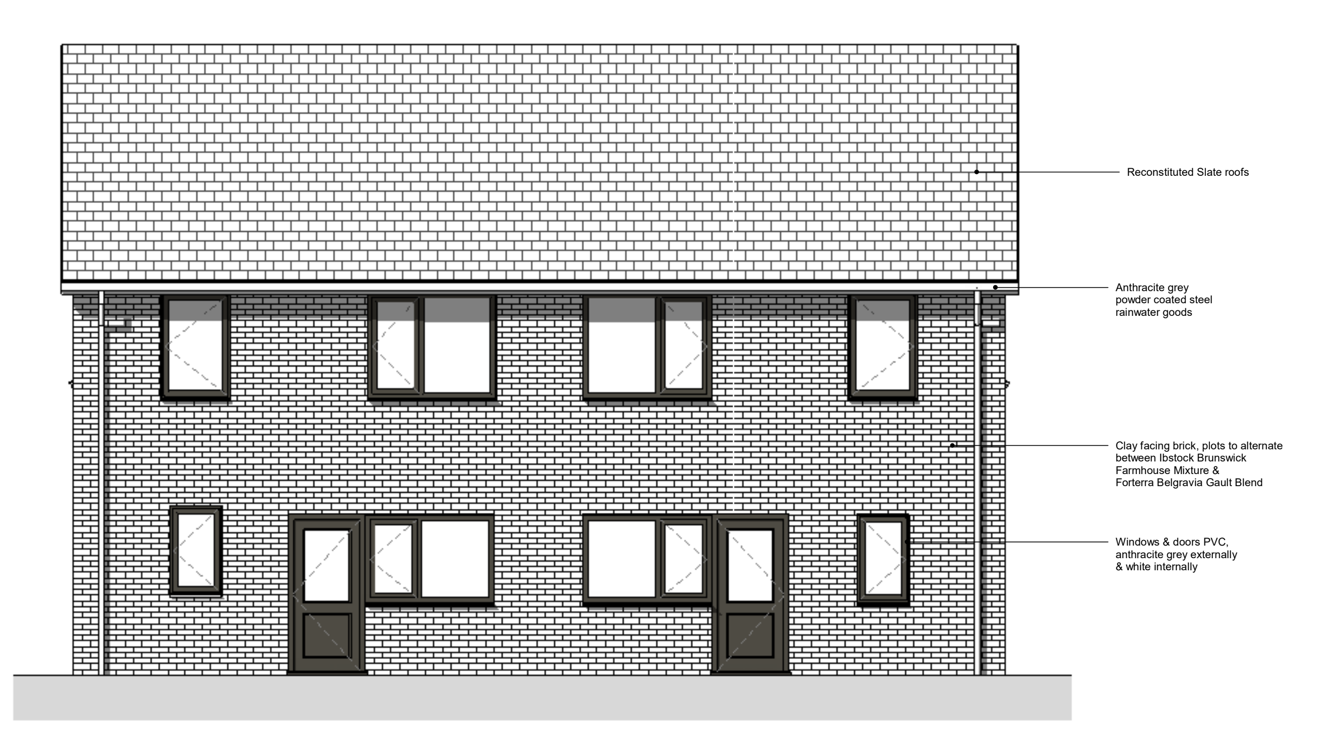
Rear Elevation as Proposed