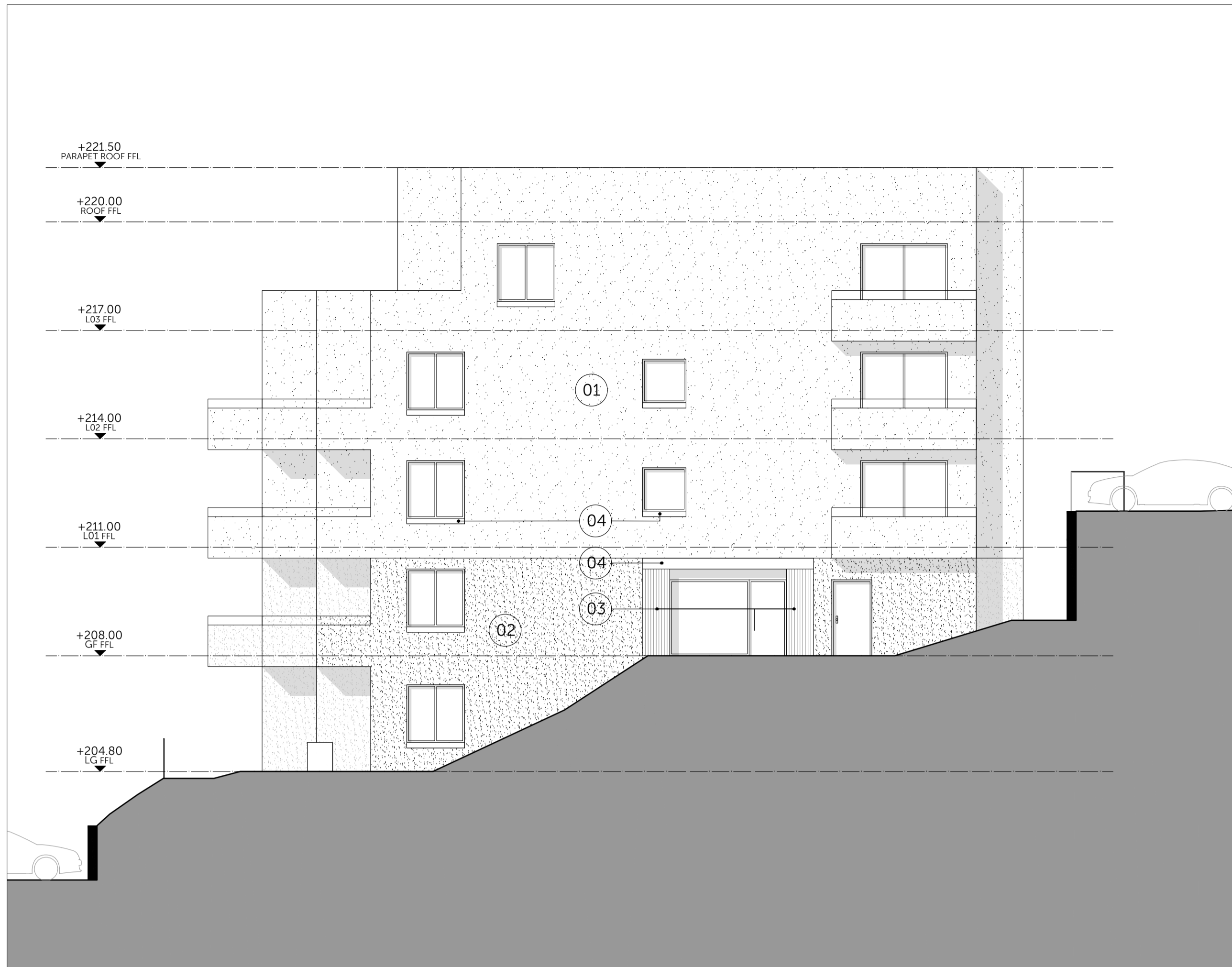
1 EAST ELEVATION BLOCK A - ENTRANCE - AA