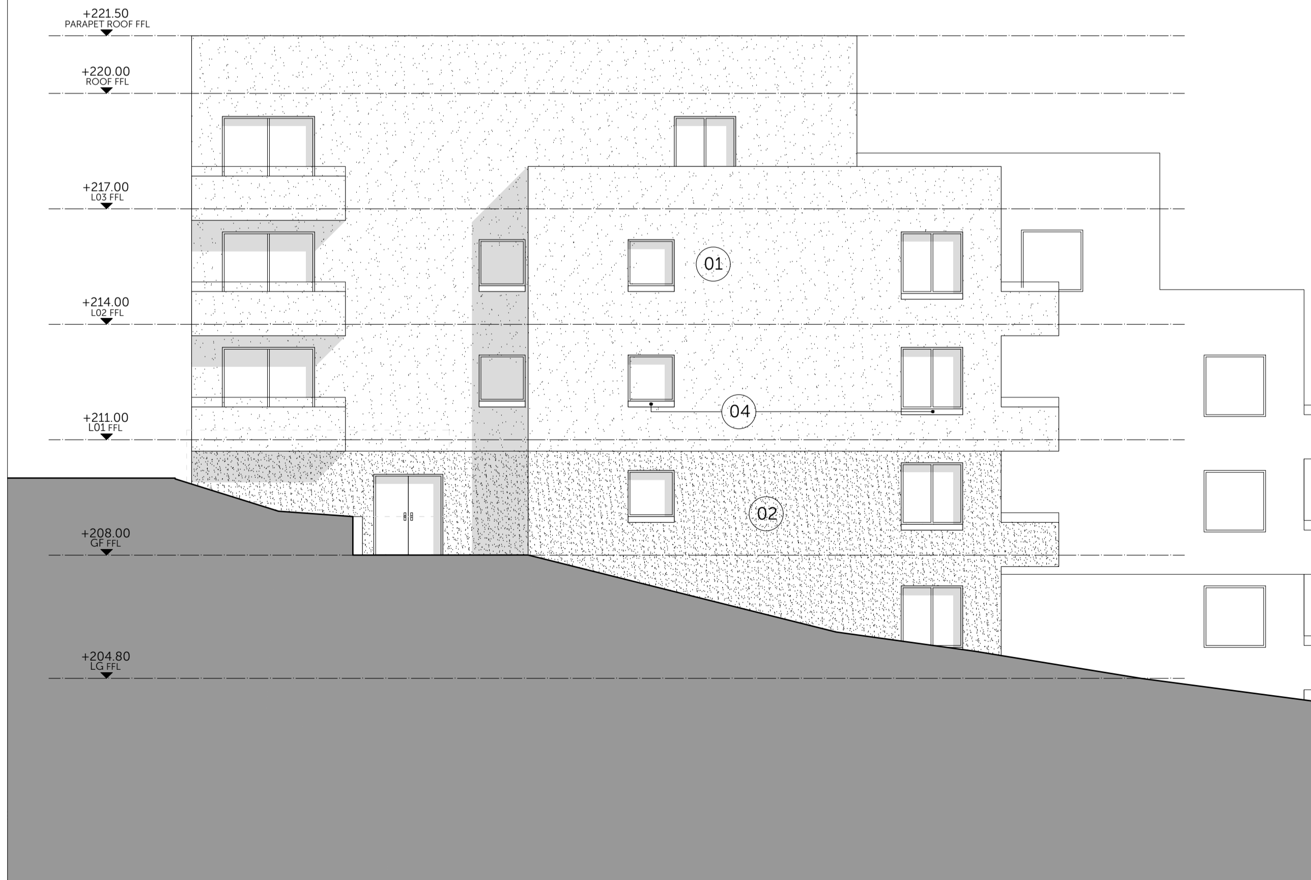
3 WEST ELEVATION BLOCK A - AC