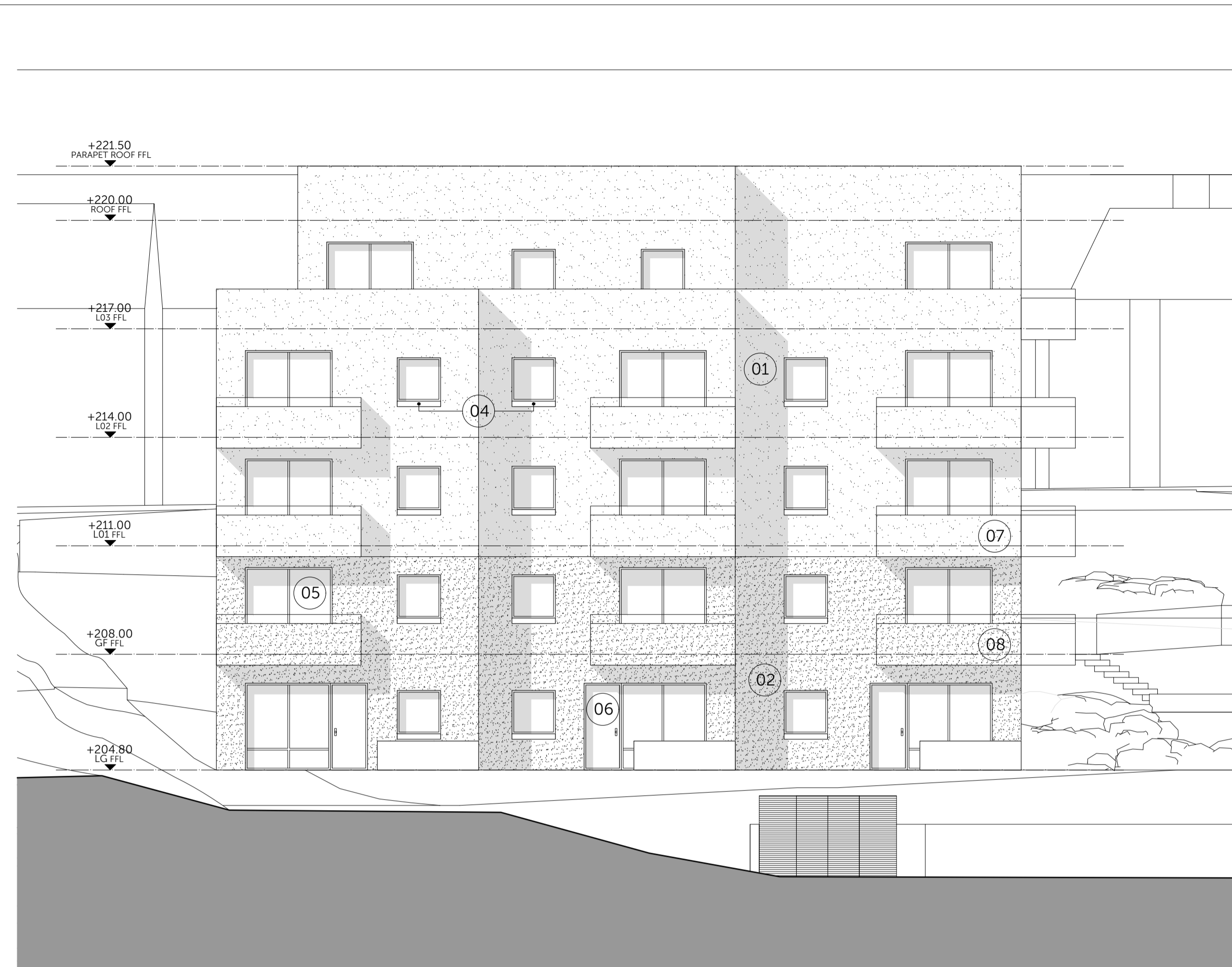
2 SOUTH ELEVATION BLOCK A - AB