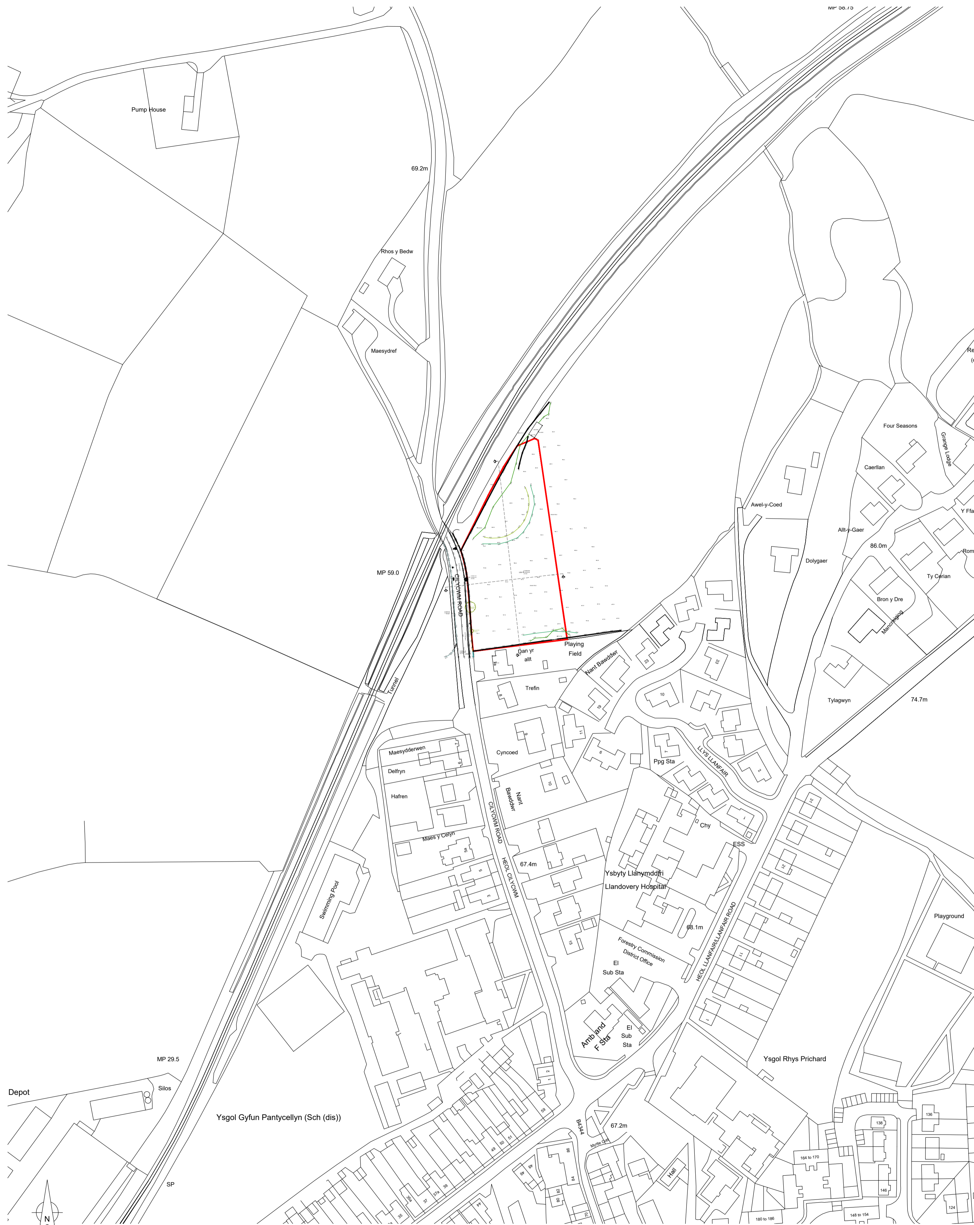
CYNLLUN LLEOLIAD LOCATION PLAN - 1:1250