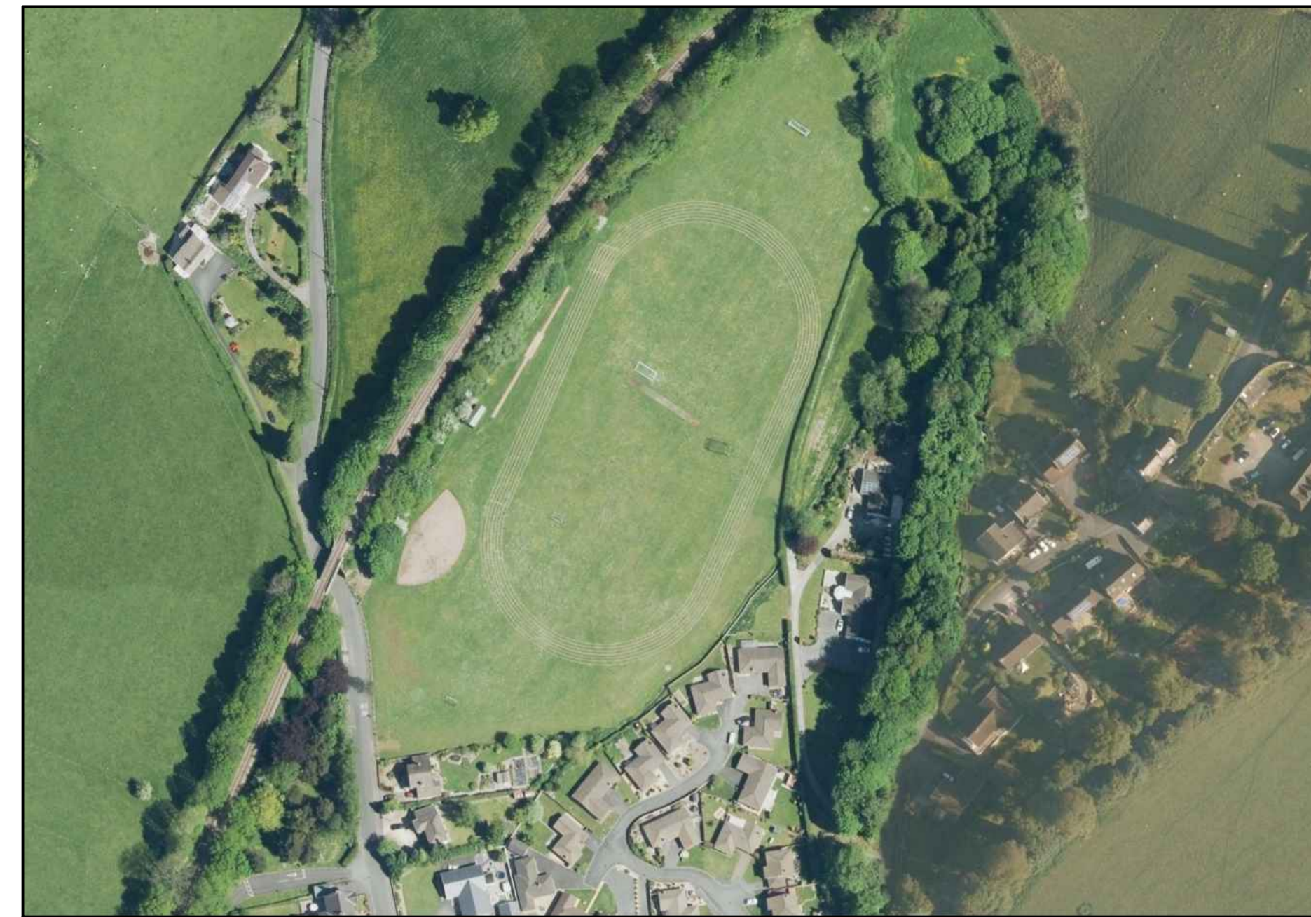
GOLYGFA O'R AWYR AERIAL VIEW - Not To Scale