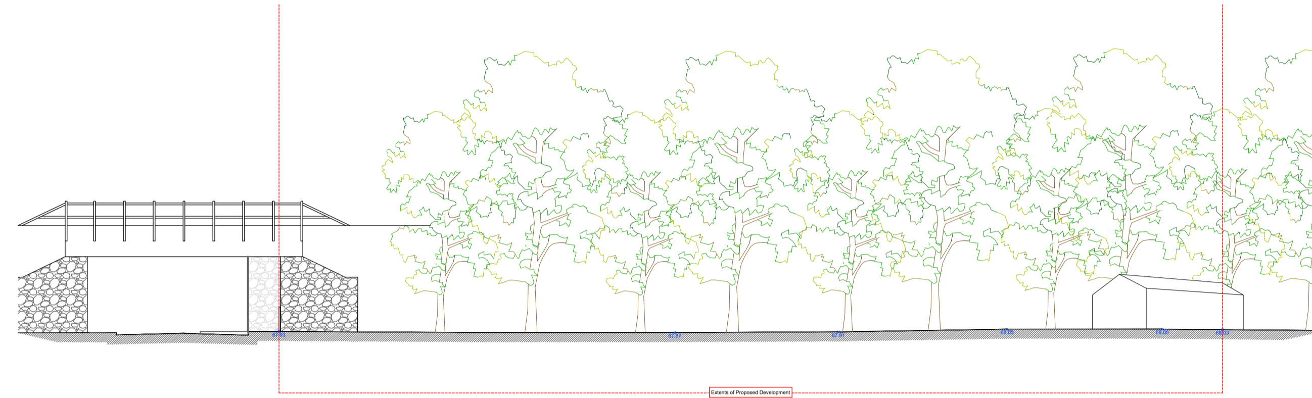
TORRIAD PRESENNOL 2-2 EXISTING SECTION 2-2 - 1:200