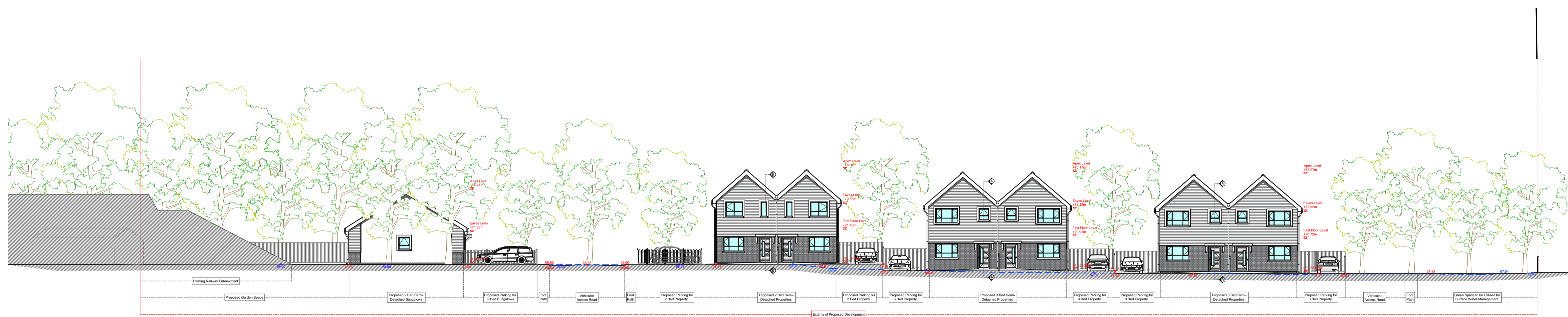
TORRIAD ARFAETHEDIG 1-1 PROPOSED SECTION 1-1 - 1:200